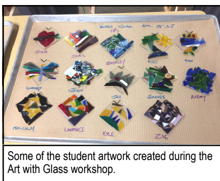
Some of the student artwork created during the Art with Glass workshop.