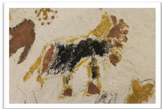
Grades 1 & 2 Art