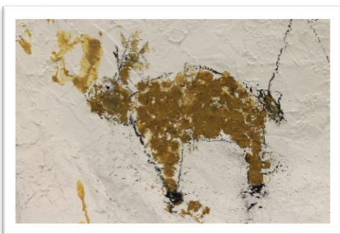
Grades 2 & 3 Art